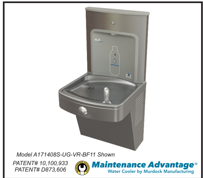
Model A171408S-UG-VR-BF11 Shown

Bottle Filler housing construction will be 20 gauge Stainless Steel with a satin finish and will also include components manufactured from Antimicrobial, impact resistant ABS. Bottle Filler shall provide approximately 1 GPM flow rate with a Laminar Flow Spout to minimize splashing.